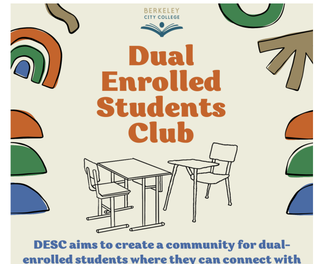
enrolled students where they can connect with each other, share resources they've found helpful, discuss how to manage schoolwork, and more!

The Dual Enrolled Students Club (DESC) was founded in Fall of 2022 as a club for high school students who are taking, or want to take classes, at BCC. DESC aims to create a community for dual enrolled students to connect with each other, share resources they've found helpful, discuss how to manage schoolwork, and overall provide support with the processes of dual enrollment. Currently, in addition to holding regular meetings every other week, the club is working on planning out events for the spring semester; such as promotion of summer classes and study jams at BCC.