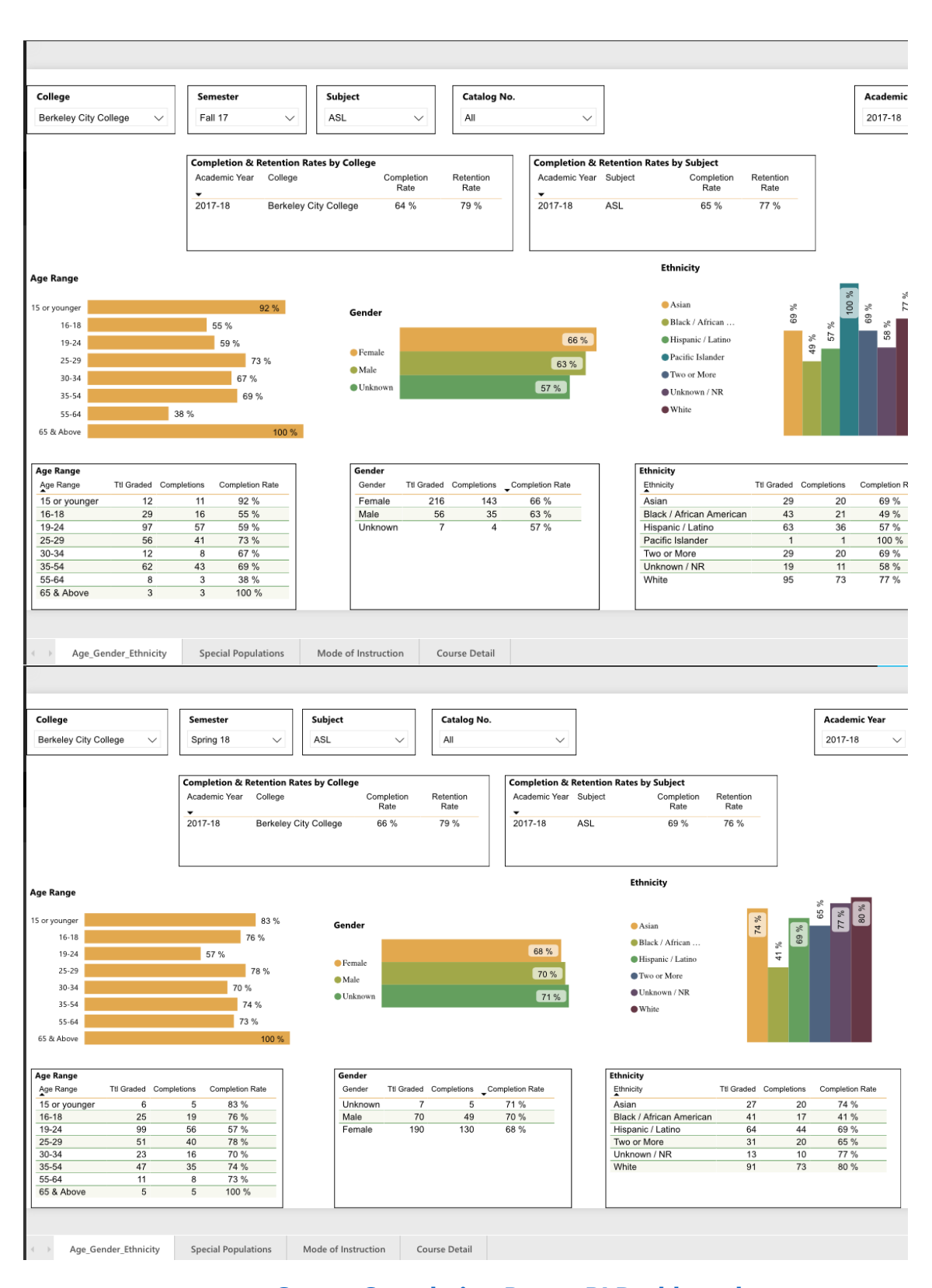
Course Completion Power BI Dashboard