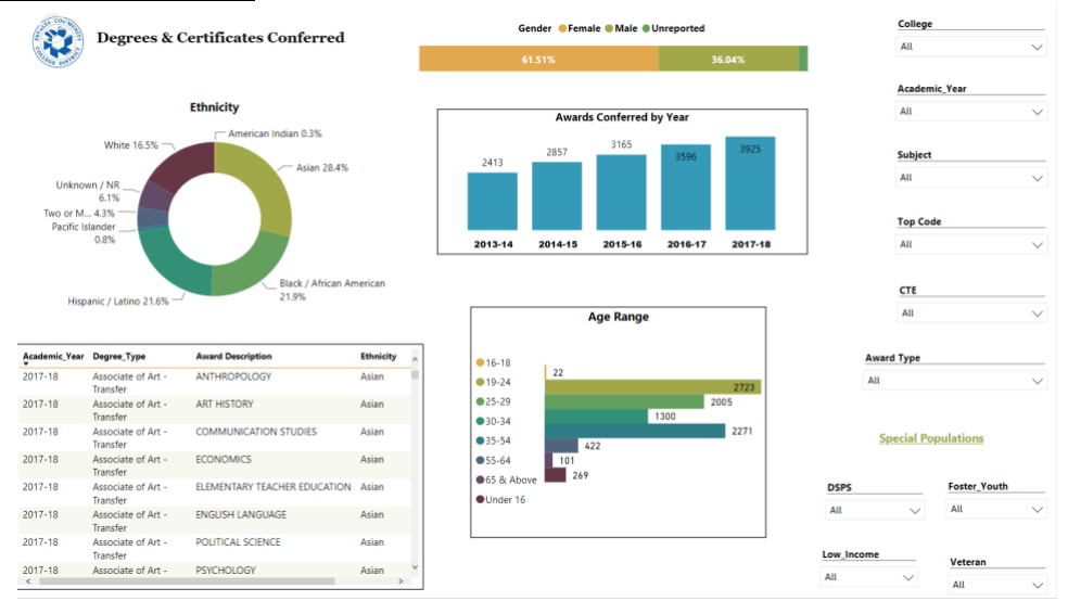
Degrees & Certificates Power BI dashboard

What has the discipline, department, or program done to improve the number of degrees and certificates awarded? Include the number of degrees and certificates awarded by year, for the past three years.