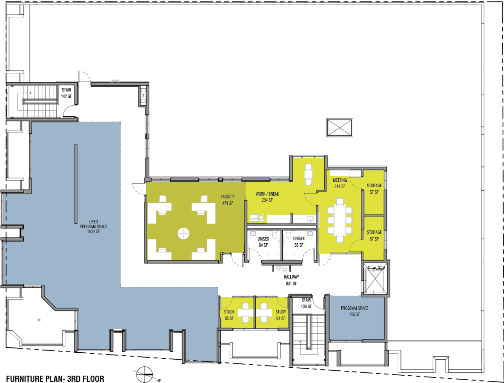
FURNITURE PLAN- 3RD FLOOR