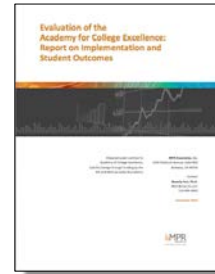
Evaluation of the Academy for College Excellence: Report on Implementation and Student Outcomes