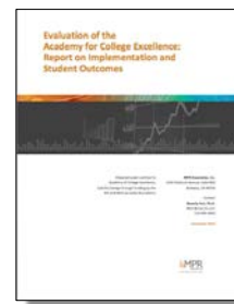
Evaluation of the Academy for College Excellence: Report on Implementation and Student Outcomes